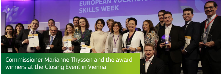
Commissioner Marianne Thyssen and the award winners at the Closing Event in Vienna