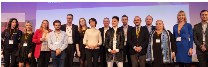
Ambassadors and the Commissioner at the Closing Event in Vienna

This year, 24 national ambassadors and two pan-European ambassadors from a wide range of sectors and companies have been promoting the value of VET through media actions, during events and activities associated with the European Vocational Skills Week, and at the Week itself in Vienna.